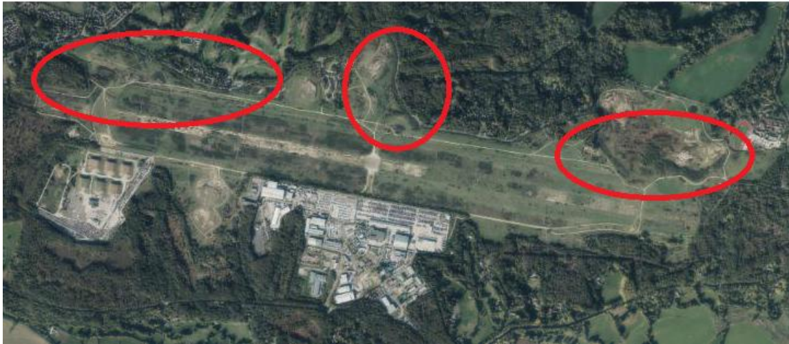
Priority areas to focus gorse clearance